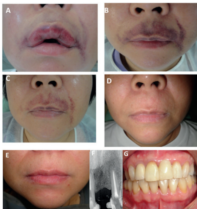
Figure 2 - Appearance of the patient at 18 hours (A), 3 days (B), 6 days (C), 11 days (D), and 17 months (E-G) after the accident.

timicrobial capacity and tissue dissolution is more effective at higher concentrations, however, inversely proportional to its tissue tolerance 2,5 . Currently, due to rapid RCP using nickel-titanium rotatory instruments and reciprocating systems, sodium hypochlorite has been used at larger concentrations. In function of sodium hypochlorite remains inside the root canal, there will be no harmful postoperative consequences for the patient 5 . However, in cases of ample contact with the apical tissues, accidents and its complications have been identified 10-23 .